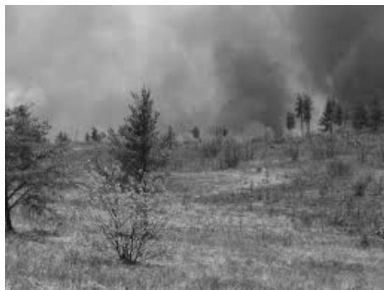
Prescribed fire at Moquah Barrens 2015

I hope that displaying male counts next year (2019) will allow continued, but limited, sharptail hunting in Wisconsin- a tradition that has existed for hundreds of years.